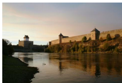
The Estonian Narva Castle and the Russian Fortress Ivangorod