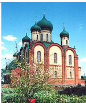
Pühtitsa Dormition Convent