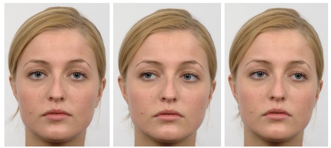
Figure 1. The images of direct, left-wards, and right-wards looking gaze of the stimulus presented in the experiment.

used as the fixation point. The target stimuli were three rectangular color images of a woman's face (Caucasian) displaying a neutral facial expression, with either a direct gaze (front-looking) or an averted gaze (left-looking or right-looking). The images were in color, 1024 x 681 px, obtained from the standardized Radboud Faces Database (Langner, Dotsch, Bijlstra, Wigboldus, Hawk, & van Knippenberg, 2010), cropped so as to focus on the face from the chin to the tip of the head, and displayed in 375 x 499 px (see Figure 1). This database was utilized due to its thorough standardization on the: depicted expression, valence of the image, and intensity, clarity, and genuineness of the expression. Additionally, the images were standardized in all other aspects (e.g., illumination, gaze-axis, image processing).