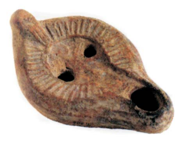
Figure 2. African-type lamp bought by G. Lampakis in Rome (Gratziou & Lazaridou 2006, 229)

country – in some times only for a very short period, as in the case of Efesos – digging up monuments of the Early Byzantine period or restoring them, as was the case with the Early Byzantine basilica of St Demetrius at Thessaloniki which had been partly destroyed by the fire of 1917.