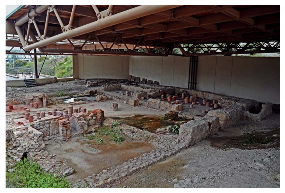
Figure 4. Open-air museum of the Department of History and Archaeology of the University of Athens; ruins coming from the Athenian Underground excavations

expression (religious, athletic, even political) would have died together with it. What modern research however has been able to show is that Delfi not only survived the transition from the old religion to the new one, but even was a flourishing city that had no need to envy other provincial towns of southern Greece. This new approach actually extends Delfi's occupation period for two and a half centuries, dating the end of the continuous period during which it was inhabited to c. 620 AD.