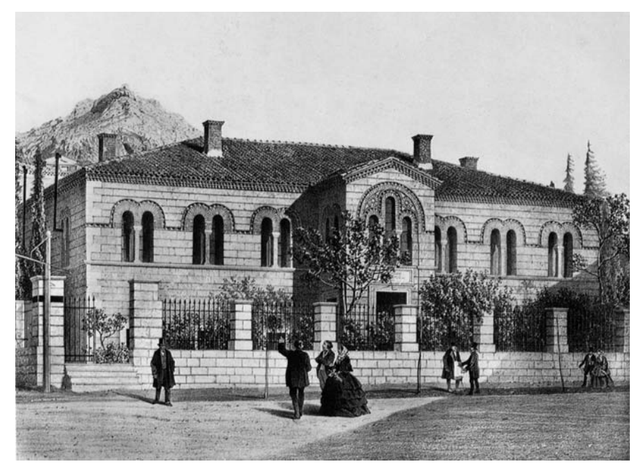
Figure 1. The Byzantine-style Eye-Hospital in Athens (http://ebooks.edu.gr/modules/ebook/show.php/DSGL106/282/2021,6897/)

founded the first Society of this kind: the Χοιστιανική Αοχαιολογική Εταισεία. <sup>5</sup> The initial objectives of the Society were the preservation of Christian monuments and the collection of artefacts in order to found a Museum of Christian Archaeology. <sup>6</sup> He was motivated by his deep Christian faith and the necessity of preserving the remains of the first centuries of Christianity '...for the Glory of the Church and of the Homeland'. <sup>7</sup> At the same time, he took many photographs during his journeys and collected thousands of items, dating mainly to the Early Byzantine period (Figure 2). These items would come to be the main core of the collections kept in the Byzantine and Christian Museum in Athens. <sup>8</sup>