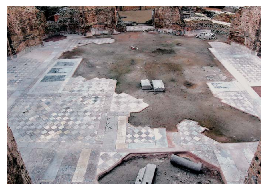
Figure 3. Galerius' Palace in Thessaloniki: the Octagon after restoration (Association of Greek Archaeologists 2007, 60)

focus on them, through courses and the experience provided by excavations. In our turn, following their example, we initiated our students into a fruitful dialogue with this period, insisting on new subjects and on the study of unpublished material. It is noteworthy that five new PhD candidates were accepted for the academic year 2011-2012 for subjects dealing with the Late Roman/Early Byzantine period, just from the Department of Archaeology and the History of Art of the University of Athens. The material culture of this period was, and still is, the subject of specialized courses and seminars. Finally, the renewal of the academic staff in the last 12 years has placed five specialists of the period to academic positions respectively in five Greek universities.