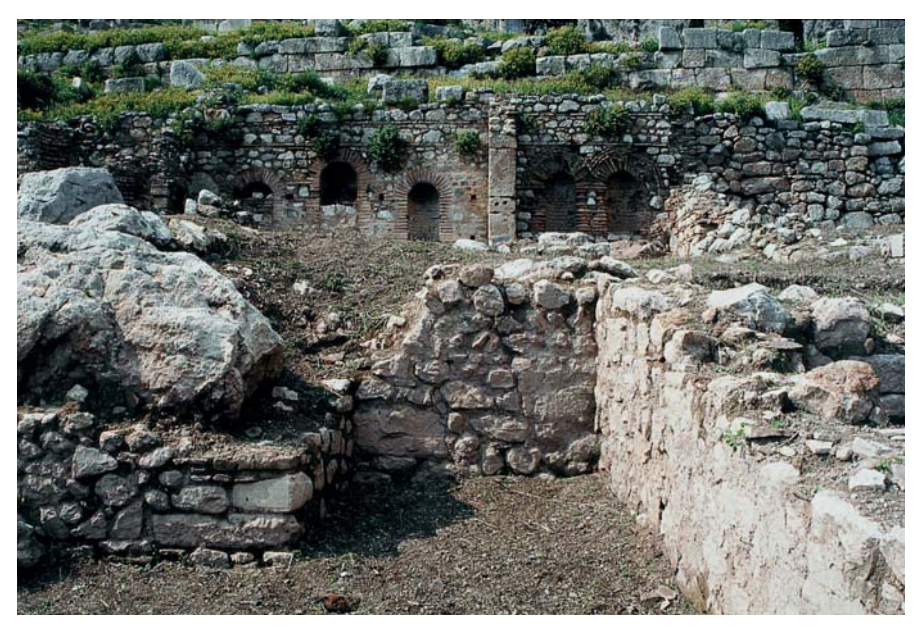
Figure 5. The South-Eastern Villa at Delfi

enriched by other private villas of the Early Christian period, however of smaller dimensions.<sup>35</sup>