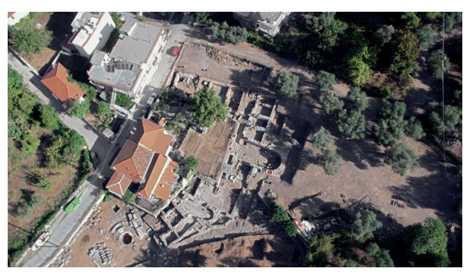
Figure 6. Domus 5 at Thasos; aerial view

being House H at Delfi.<sup>39</sup> The eastern aisle of the house contained a large apsidal triclinium framed by rectangular rooms. A series of rooms with different functions was developed to the north, while a small thermal complex, originally covered with marble was situated to the south. A large part of the house, most probably the atrium, is covered by a neighbouring property, rendering the accomplishment of total excavation almost unfeasible. Internal decoration comprised frescoes, mosaics and sculpture. Exactly as in the case of the South-Eastern Villa of Delfi, a radical change is attested to the house around 570/580. It continues to be inhabited until around 620 AD, but some of the rooms seem to have been condemned and the diet of the population was based on hunting and shell fishing. The excavation of Domus 5, still in progress, will provide us with new data which will probably help us understand better the local end of the Early Byzantine period on the coastal sites of the island.